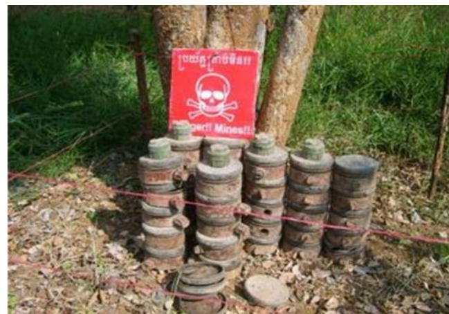
4-6 million landmines NW provinces