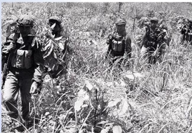
Internal and regional conflicts