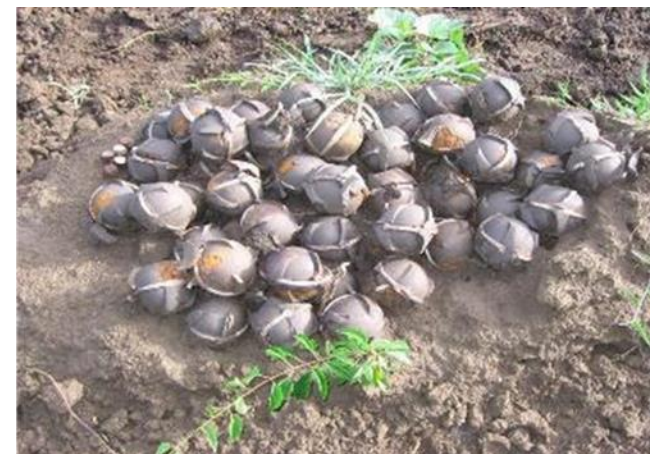
Bombs and CM in eastern provinces